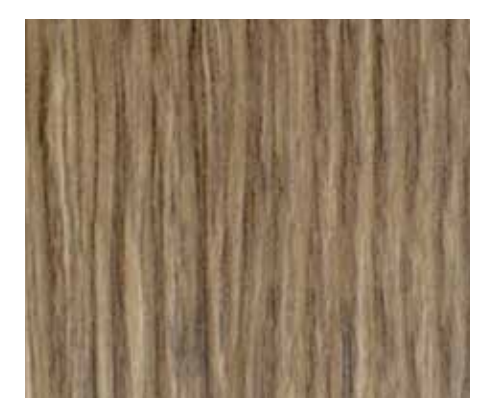
Natural Halifax Oak