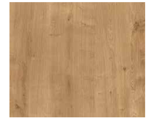
Natural Hamilton Oak