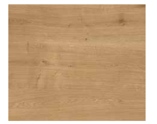
Natural Hamilton Oak