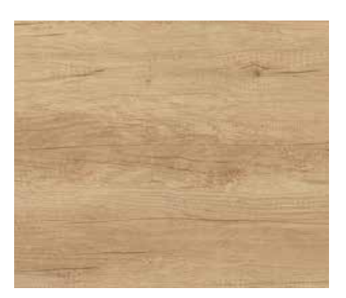
Natural Nebraska Oak