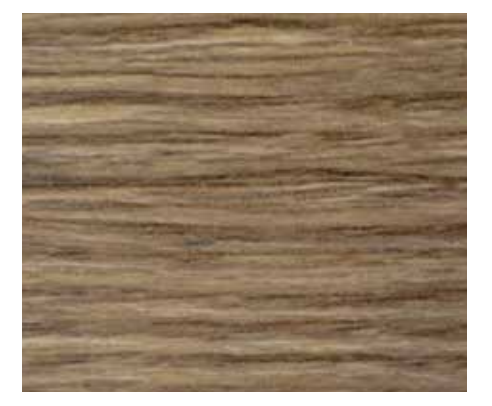
Natural Halifax Oak