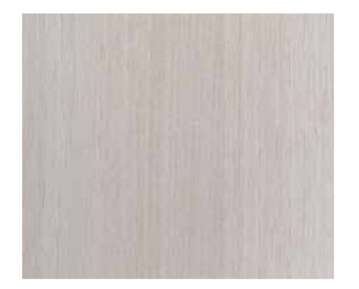
Light Lakeland Acacia