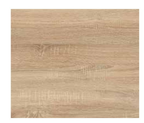
Natural Bardolino Oak