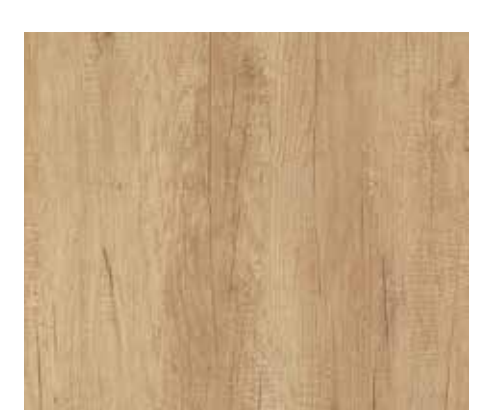
Natural Nebraska Oak