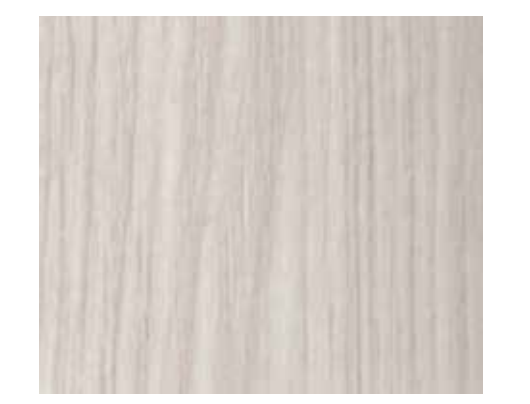
Polar Aland Pine