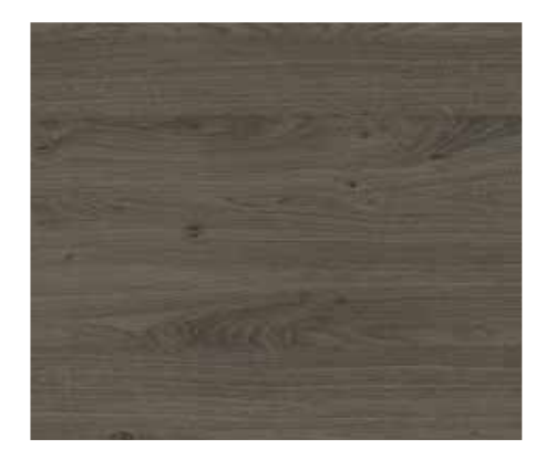
Graphite Denver Oak