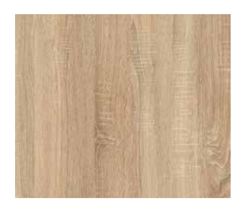
Natural Bardolino Oak