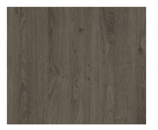
Graphite Denver Oak