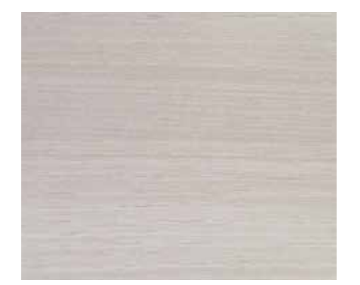
Light Lakeland Acacia