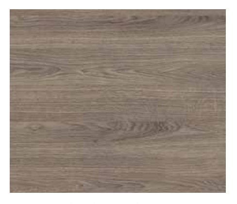
Grey Corbridge Oak