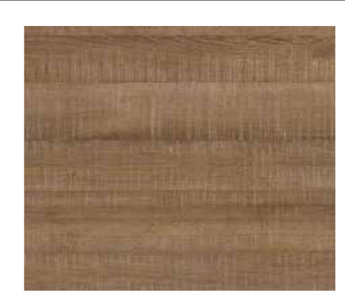
Brown Arizona Oak