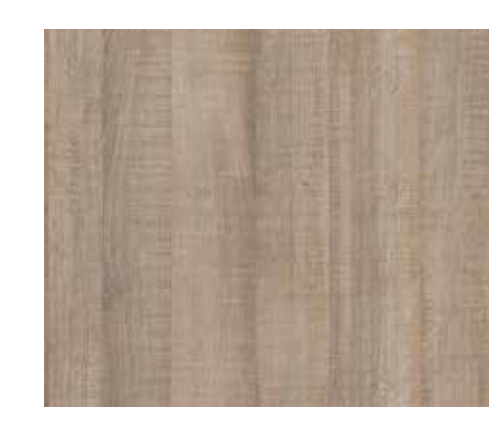
Grey Arizona Oak