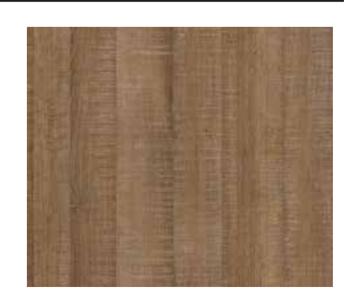
Brown Arizona Oak