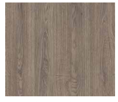
Grey Corbridge Oak