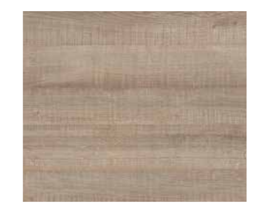
Grey Arizona Oak