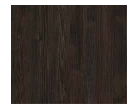
Black-Brown Thermo Oak