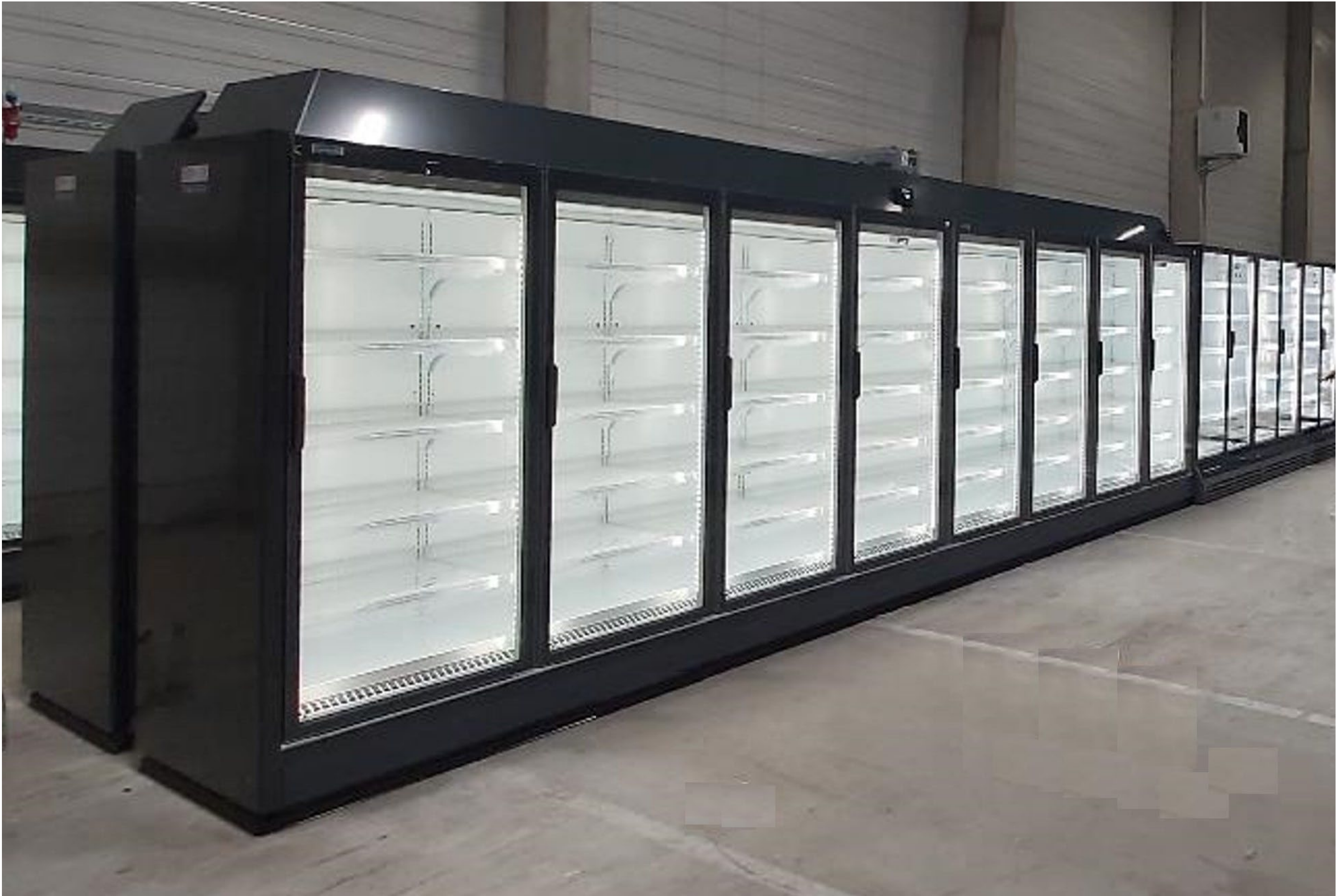
Dark store warehouse with SkyLight Integral Perform and SkyView Integral

This information is confidential and was prepared by Epta solely for our internal use. It is not to be relied on by any third party without Epta prior written consent. Marketing 09/2020