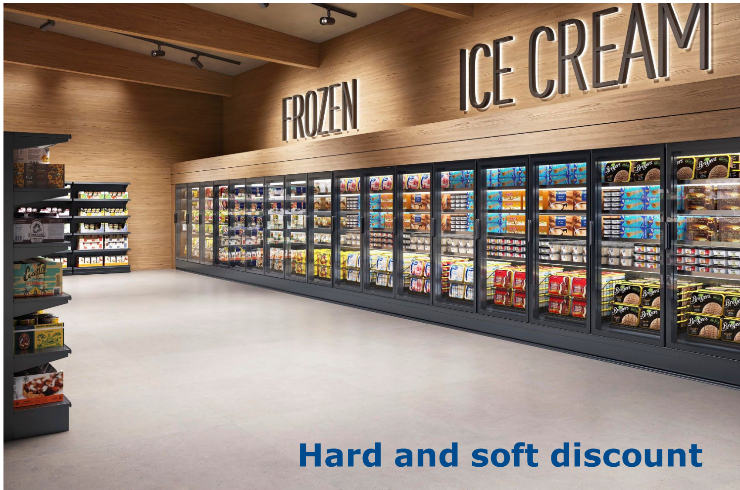
Hard and soft discount

SkyLight Integral Perform is dedicated to all retail activities