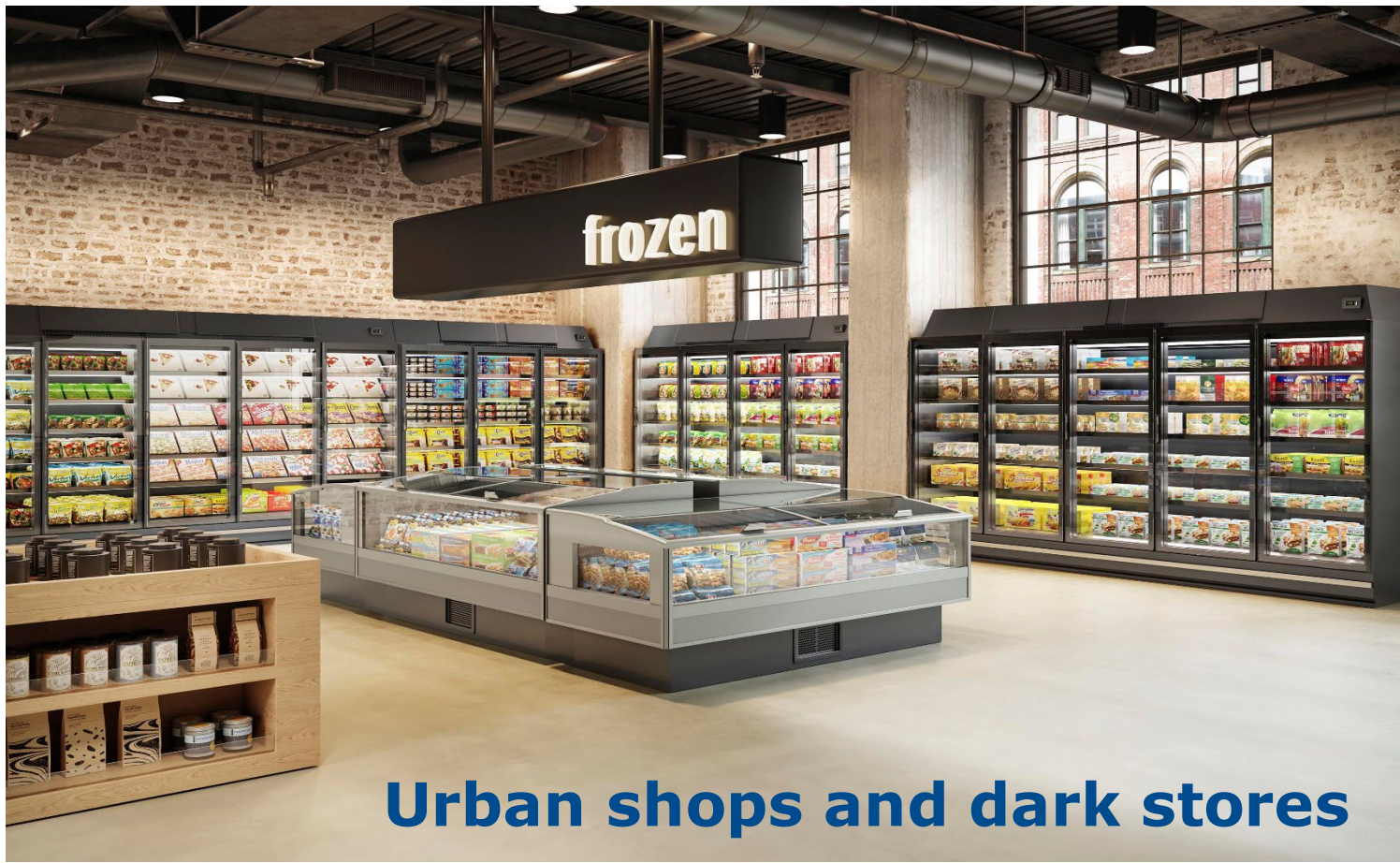
Urban shops and dark stores