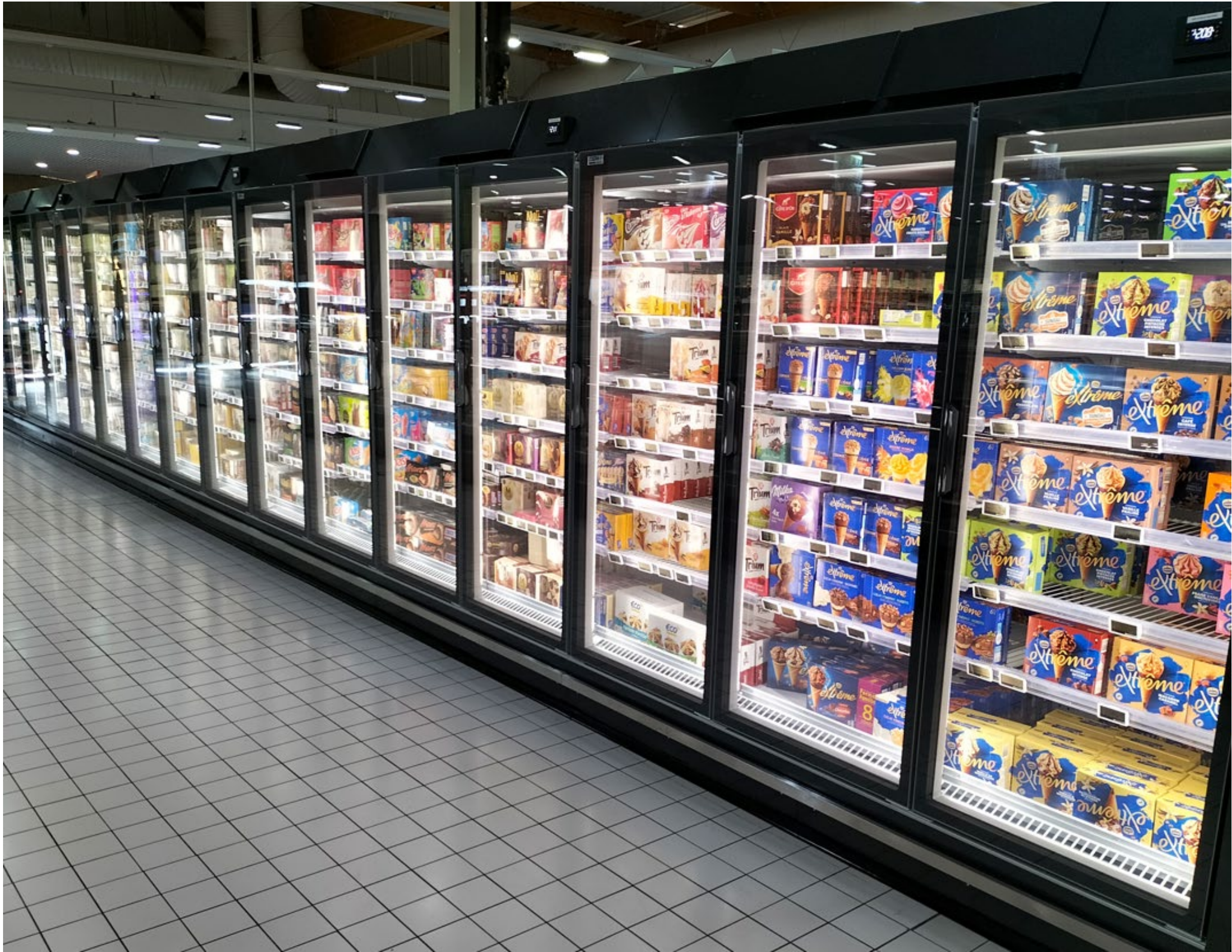
SkyLight Integral Perform 17 doors linear