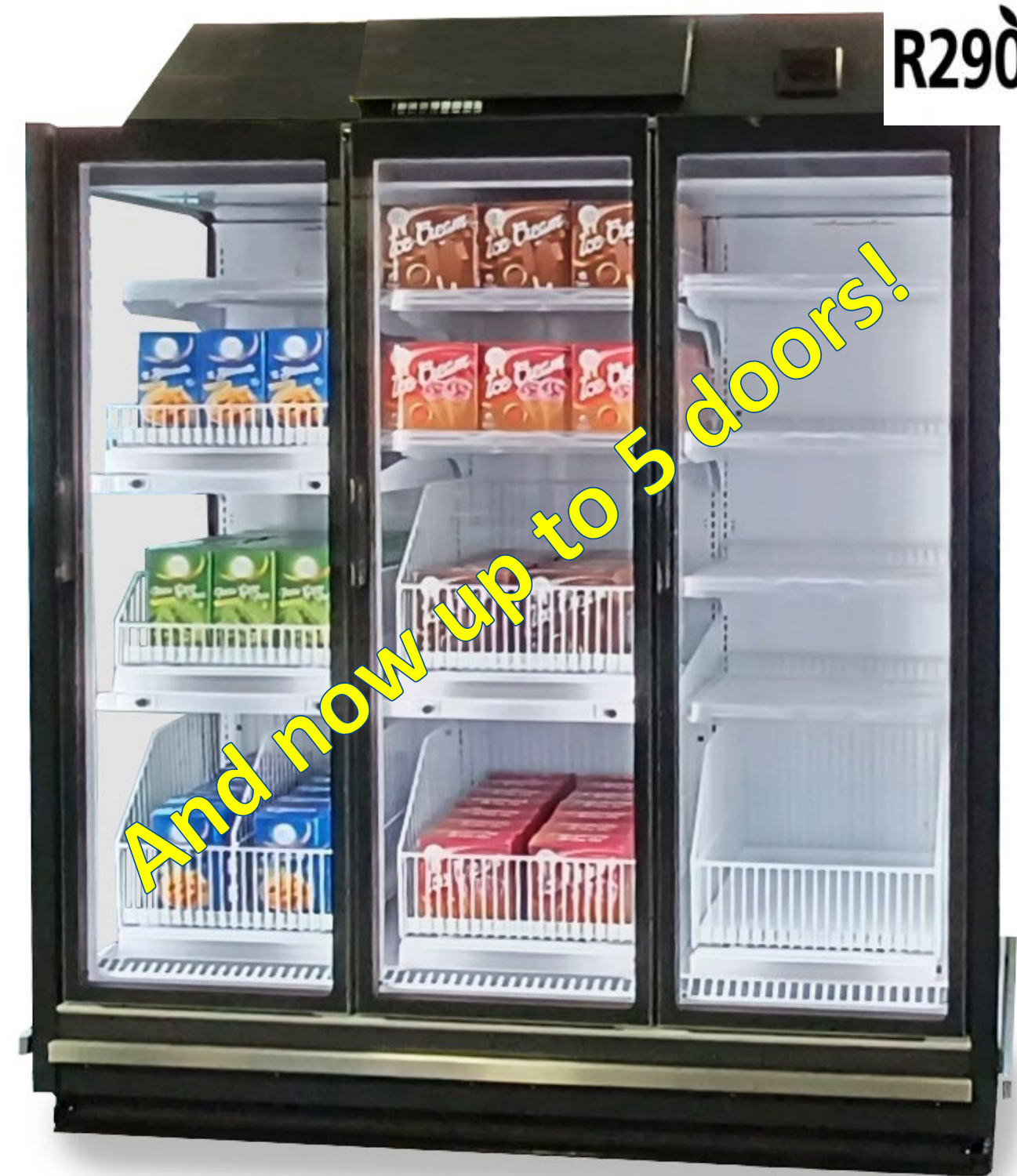
New SkyLight Integral Perform

SkyLight Integral Perform is a plug and play full integrated vertical freezer offering you the opportunity to replace the remote power pack dedicated to frozen area.